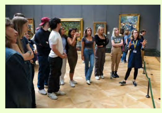
Year 12 Art & Photography students recently went to the National Gallery, National Portrait Gallery and the Tate Modern to seek inspiration for the second year of their courses. An inspiring day was had by all.