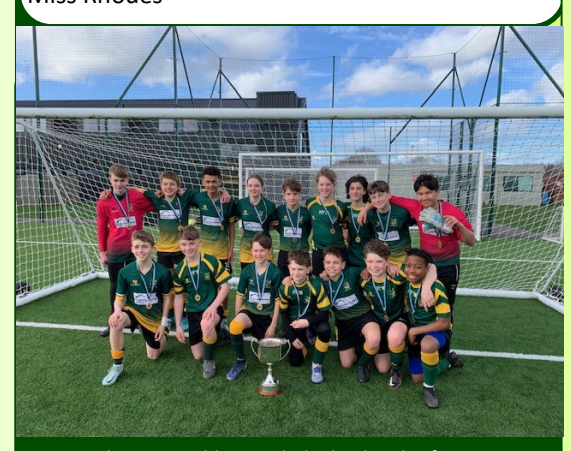
It is not always possible to include the details of every sporting fixture which takes place in school in the newsletter. May we take this opportunity to thank parents / guardians for supporting our co-curricular sports offer.